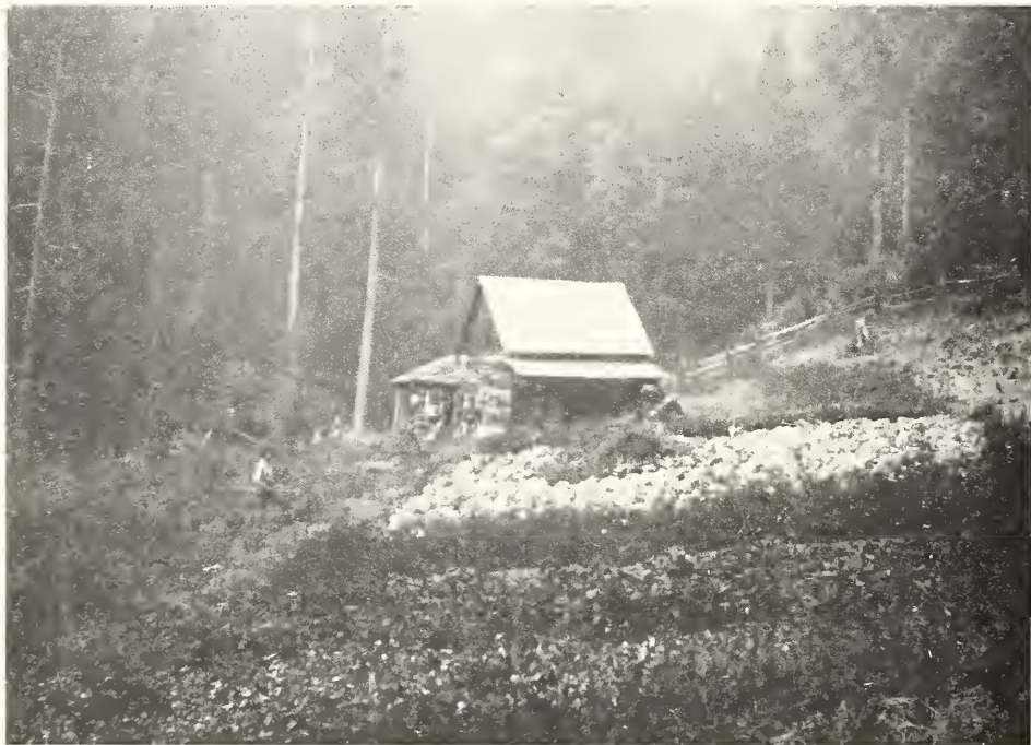
Figure 9. Homestead in the Upper Wagner Creek drainage, 1910. Note cleared timber and garden plot.

Although usually found on reasonably level land and near a water source, these "stump ranches" can be expected almost anywhere in the low-to-medium elevation Cascades. Circa 1910 photographs of "squatter locations", taken by Federal Claims Examiners, show some perched on forty percent slopes. Almost three-quarters of the inventoried sites are located within Standard CFL. This is entirely logical given the fact that many claims were entered with the eventual timber harvest in mind.